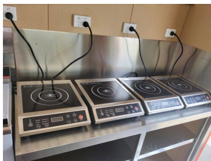
- Electric Stoves -