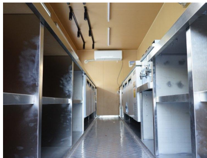
- Storage -