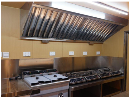
- Cooking Equipment -