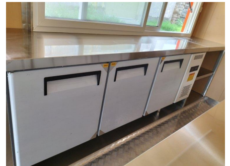
- Refrigerator -