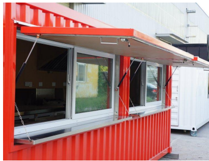
- Window -