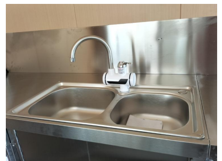
- Sink -