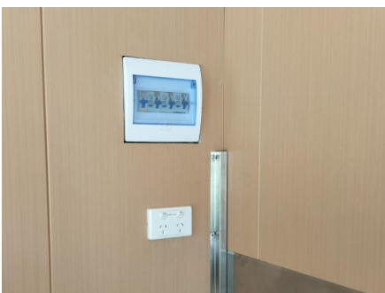
- Electrical System -